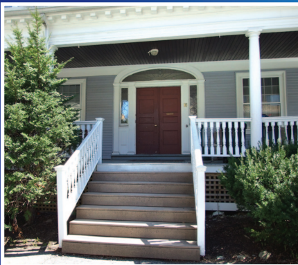
Humanity House, Brookline